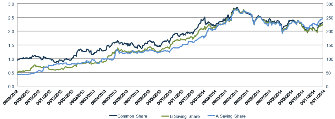
Market Prices of the Common Shares and the Class A and Class B Saving Shares

The market prices of the three categories of shares of UnipolSai have registered a volatile trend, which reflects the trend of the Italian stock market in the aggregate as well as specific situations of UnipolSai and of the Unipol Group, registering, in the reference period, a positive trend respectively equal to +144% for the common shares, +441% for the Class A Saving Shares and + 331% for the Class B Saving Shares.