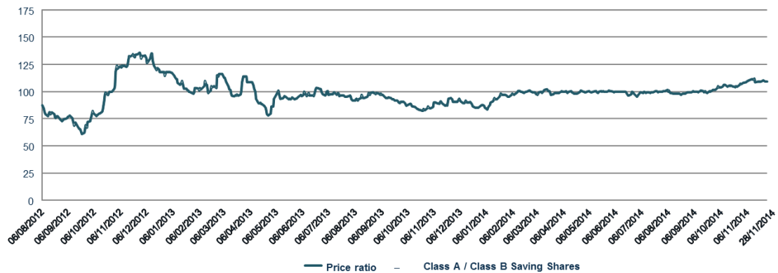
Price ratio - Class A / Class B Saving Shares

The conversion ratios embedded in the trend of the Saving Shares compared to the common shares, in the reference period, are represented in the diagram below.